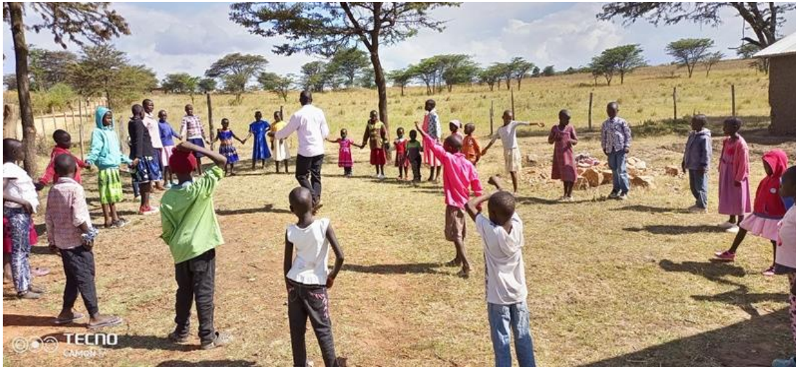
Sunday school and junior youth at Bondeni church of Christ