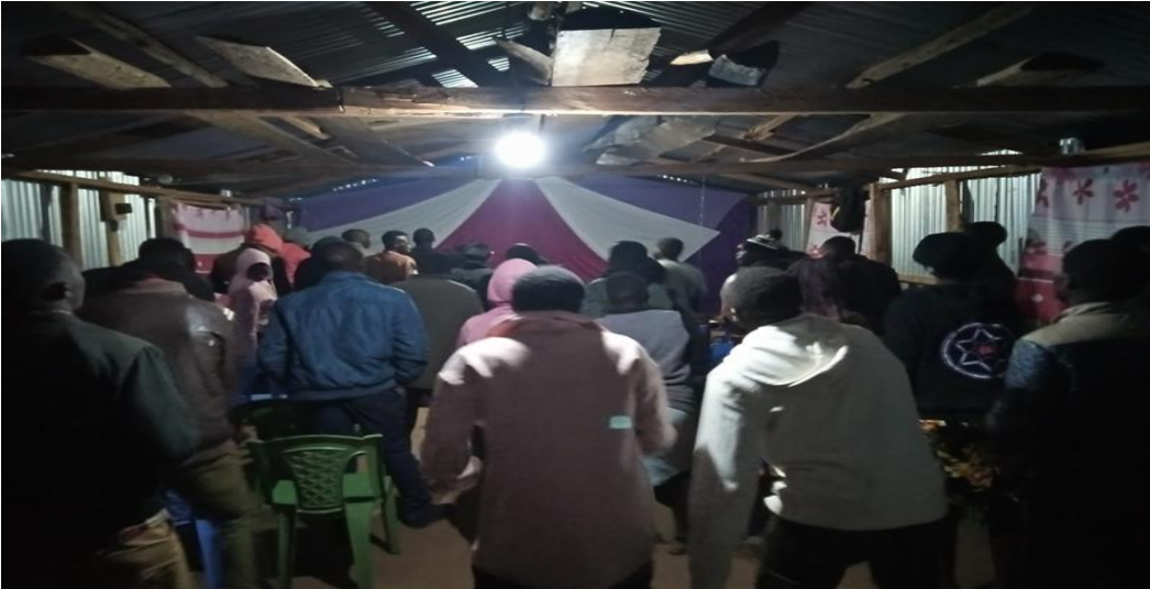
New Year crossover at Mt Olives