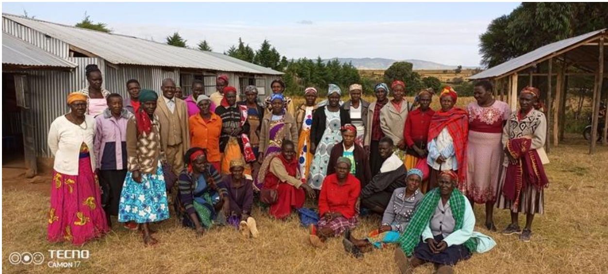
After a meeting at Mt. Olives

We do praise God for this group of widows/widowers whom he us opportunity to work with the number has been increasing rapidly. Though like any other group they were affected by December activities. God has been faithful to them in all areas though we need to be encouraging them always to stay in the word of the lord. They have decided to start projects, starting chicken rearing; followed by bee keeping, sheep keeping as they grow to keep cows among others. We trust the lord on this to support them and also encourage them to depend on themselves. Below are some of the pictures during meetings.