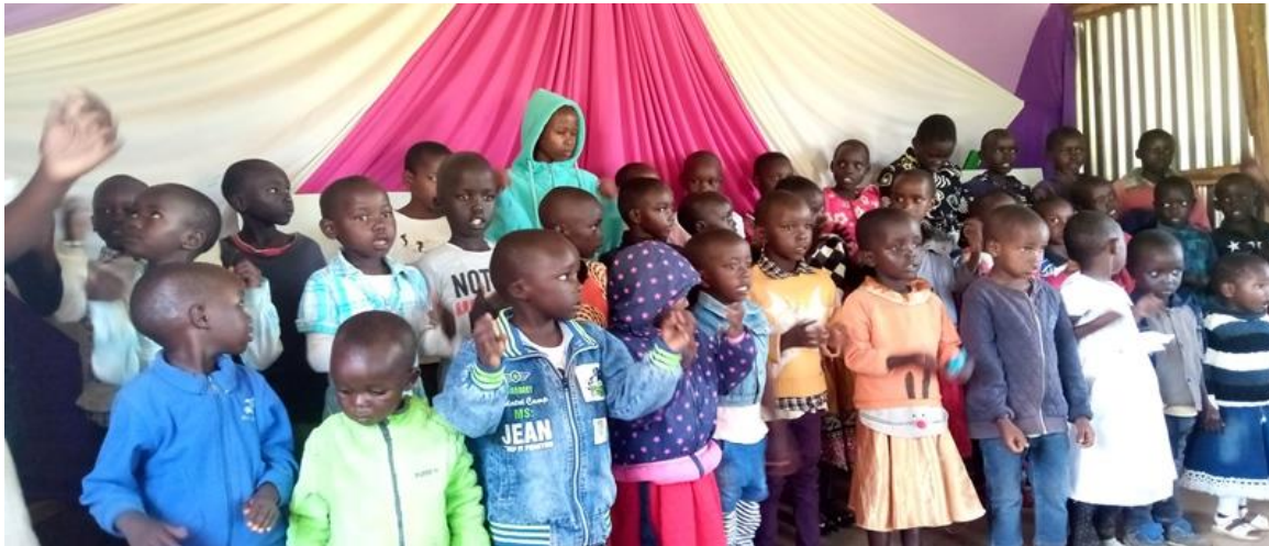
Sunday school program at Mt Olives

Sunday school has been going on well but we need to put more effort to reach more. This year of 2022 we will begin the program at Mt Olives church to reach the Sunday school and junior youth. I do hope we will be able to accomplish that this year. Below are the pictures for Sunday school and junior youth.