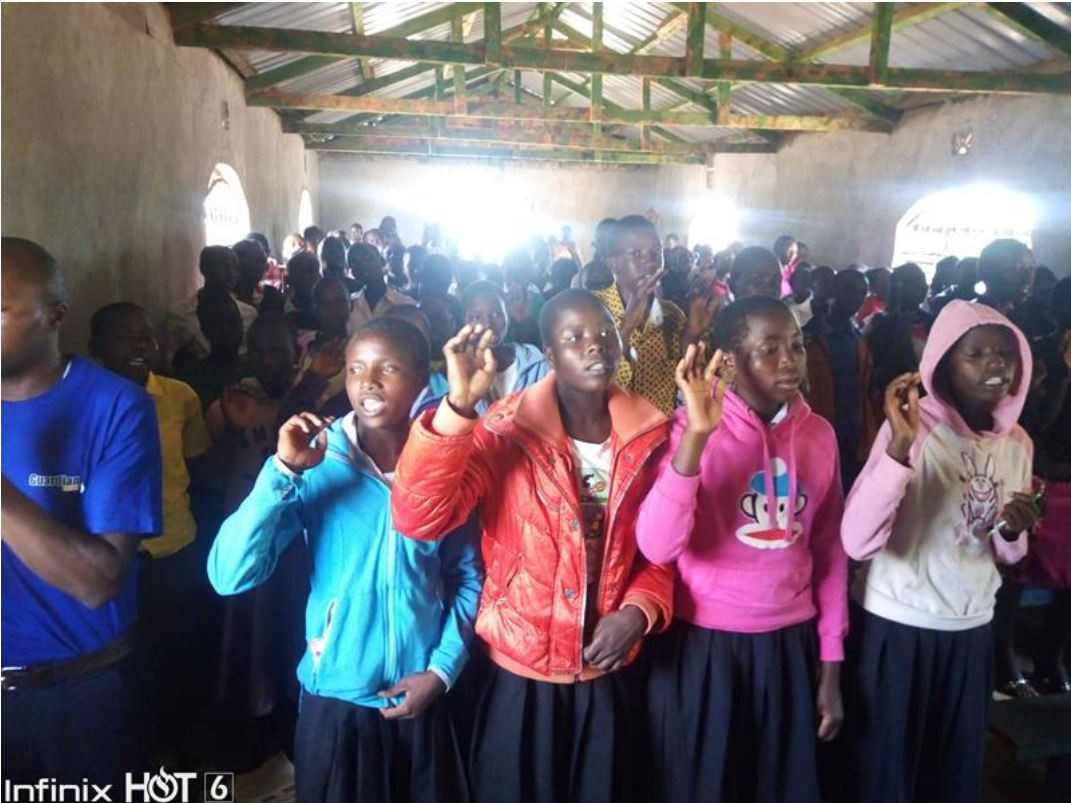
Worship time at Tungururwet Church of Christ

Chosen generation shining stars evangelical team @2021