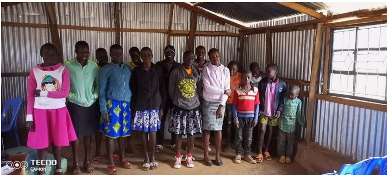
Some of the junior and senior youth at Mt Olives

These are the few youth that we did come across during the short holiday. We are trusting the lord to lead us and show us direction. This year we had many challenges but our God was faithful he delivered us from the hands of the devil. School calendar affect us in some way that we could not do our normal programs. Also December being the busiest month there are many ceremonies people are engaging them selves on that and some even forget to serve God. We are for God intervention to redeem them and use them as your vessels. Below are the pictures of junior and senior youth.