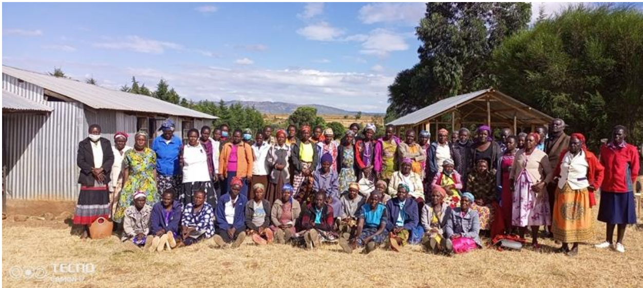
Chosen generation shining stars evangelical team @2021